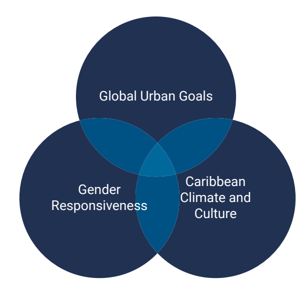
Figure 1. The intersecting contexts of the RISS Cities Model

The initial research was a desk-based study, which drew largely on publicly available documents and reports, government websites, academic articles and other resources such as the Her City Toolbox. A working paper was drafted to be further informed and developed through consultations with urban and gender development specialists from the public and private sectors, non-government organizations, academia and other sources. The core premise of the Model is the intersection of three contexts: the global goals and related urban agenda; improved social inclusion related to gender and other vulnerable groups: and the realities of Caribbean SIDS, as illustrated in Figure 1. This initial draft of the Caribbean RISS Cities Model was then reviewed in five national consultations and one regional one; the Model will be updated based on this feedback for further validation in a regional consultation prior to the finalization. The detailed country notes for each of the five countries consulted will be included in the final report. The countries included for consultation at this stage are The Bahamas, Belize, Jamaica, Saint Lucia, and Trinidad and Tobago.