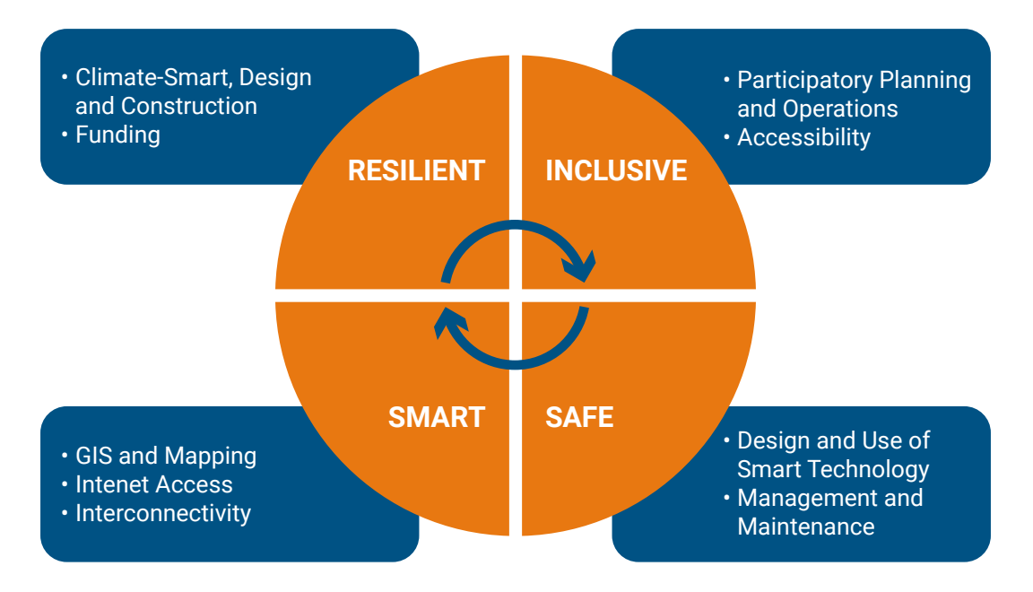
Figure 3. The Elements of the Caribbean RISS Cities Model

The Caribbean RISS Cities Model is applicable at different levels in developing and funding public spaces projects, including by legislators and administrators, urban planners and other designers, as well as by managers and operators of public spaces.